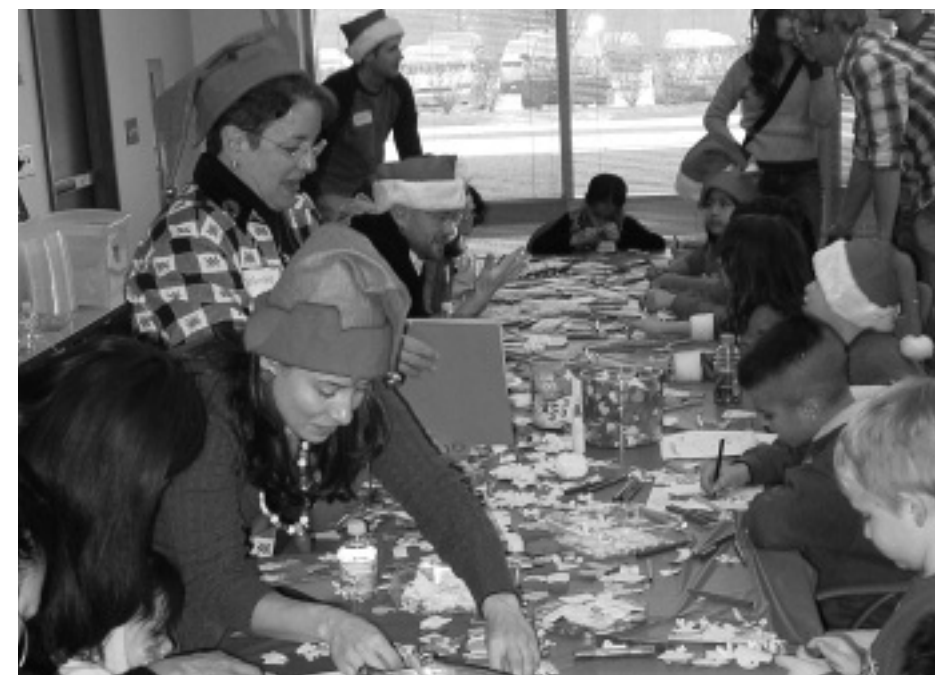
RJA and SAKO employees volunteer at the 2007 Children's Christmas Party held annually at the Loyola Hospital Burn Center in Chicago. Loyola was one of the first burn centers in the country to implement a SOAR program.

RJA is proud to announce that we have become a Platinum Sponsor of the Survivors Offering Assistance in Recovery (SOAR) program designed by The Phoenix Society for burn survivors and a national committee of experts. Since 2001, SOAR has been providing training to burn survivors, primarily children, and their family members who want to volunteer to help others whose lives have been touched by a burn injury.