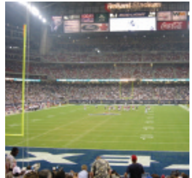
Reliant Stadium , Houston, TX