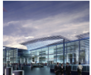
Suzhou International Exposition Center , Suzhou, China

Venetian Resort Hotel Casino - Las Vegas, NV