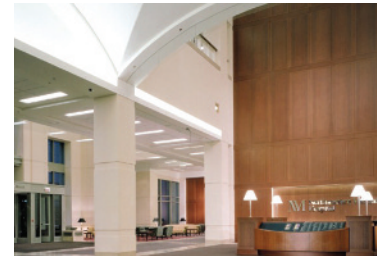
Northwestern Memorial Hospital, Chicago, IL