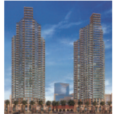
The Grand at Santa Fe, San Diego, CA